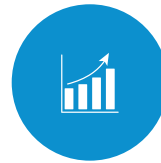
Revenue Intel Dashboards