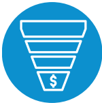
RightLeads is Go To Market ready